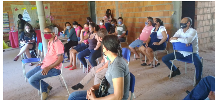
November 2021. Conversations between ATEMDO and the Nascente do Calindó Community Association. Dialogue on Home-based Work, Solidarity Economy, and Rotating Funds.